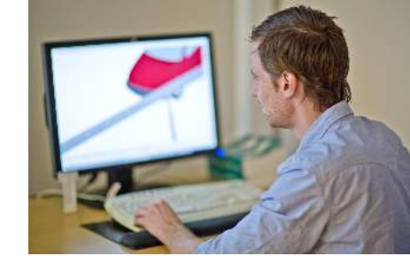
Seminars & Training View scheduled